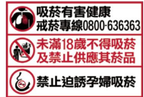
© Warning information at point of sale for tobacco product