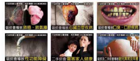
© Tobacco Warning Labels on Tobacco Products