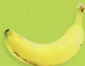
1 medium banana